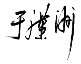
Decreto n.º 18/2008